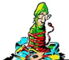
Return to PC Hell